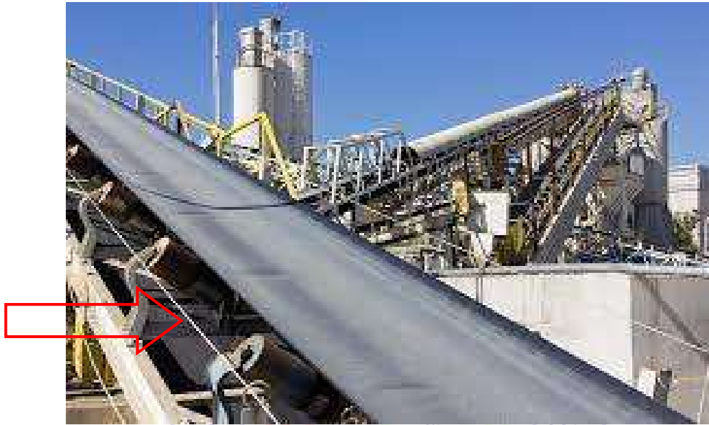
Fig.4, Pull Cord Switch

Guard/Fenced to Conveyor: Adequate guard always ensures safety of personnel. Guard always keeps away to personnel or body parts of personnel from potential danger zone of conveyor. Nip point of conveyor is major sources of accident. Some time personnel body parts exposed between roller and conveyor and this results accident. So always ensure effective and suitable guard or fencing on rotating parts of conveyor.