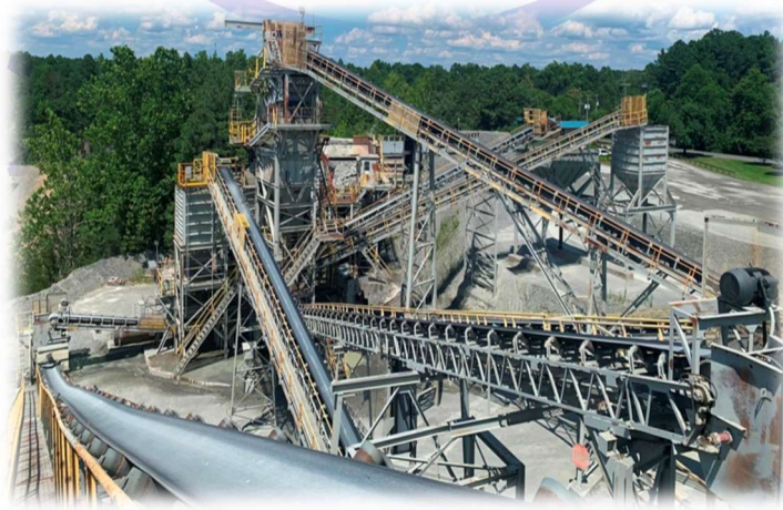
Fig. 3, Conveyor System

Conveyor-related hazards include inadequate or no guarded to gears, sprocket and chain drives, belts and pulleys, horizontal and vertical shafting, power transmission couplings & other rotating parts. Hazard means such sources that have potential to cause harm. Harm may be in the term of injury or fatality or damage to equipment whenever person expose from such sources or conveyor equipment fail.