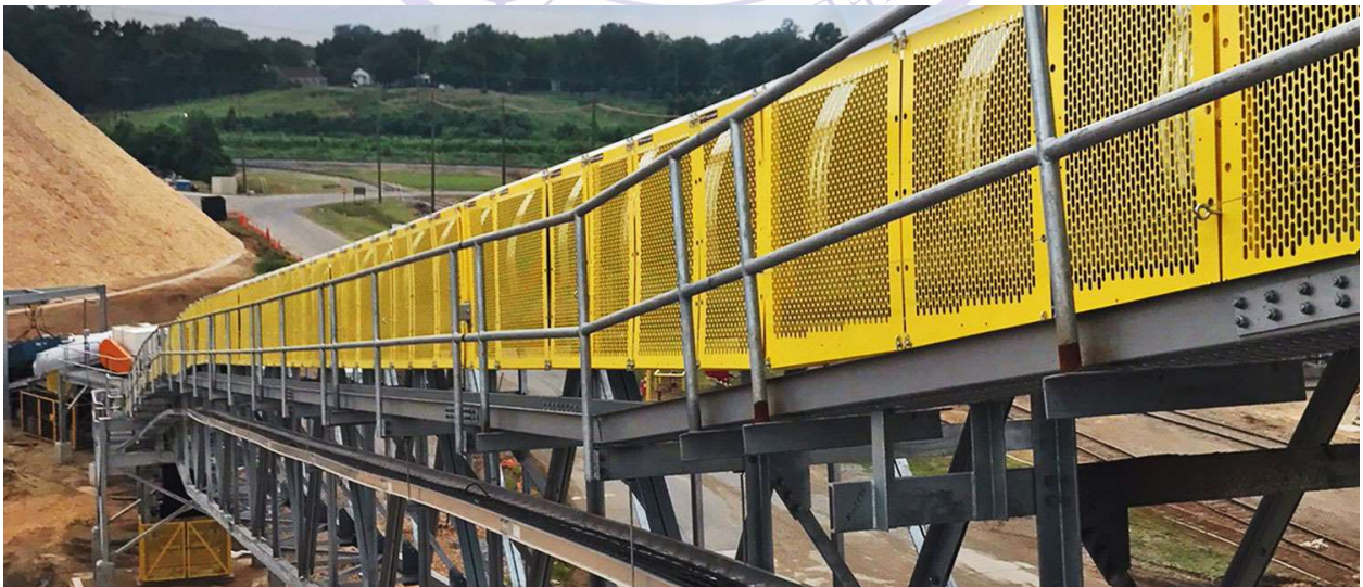
Fig. 5, Fencing/Guard of Conveyor Parts

Guard/Fenced to Conveyor: Adequate guard always ensures safety of personnel. Guard always keeps away to personnel or body parts of personnel from potential danger zone of conveyor. Nip point of conveyor is major sources of accident. Some time personnel body parts exposed between roller and conveyor and this results accident. So always ensure effective and suitable guard or fencing on rotating parts of conveyor.